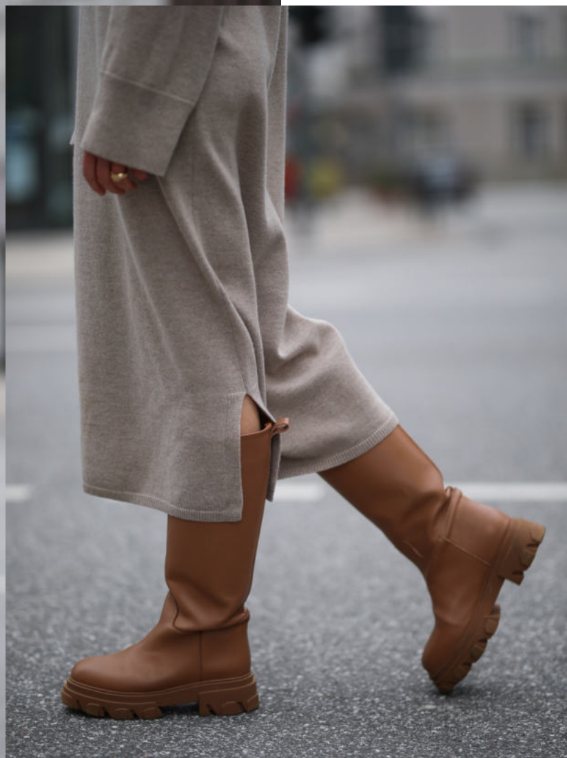
Jasmin Dress - Farbe: Bamboo, Grey & Black Art.-Nr.: M321655 VK-Preis: 299,00€ Größe: XS/S & M/L Material: 90% Wool 10% Cashmere