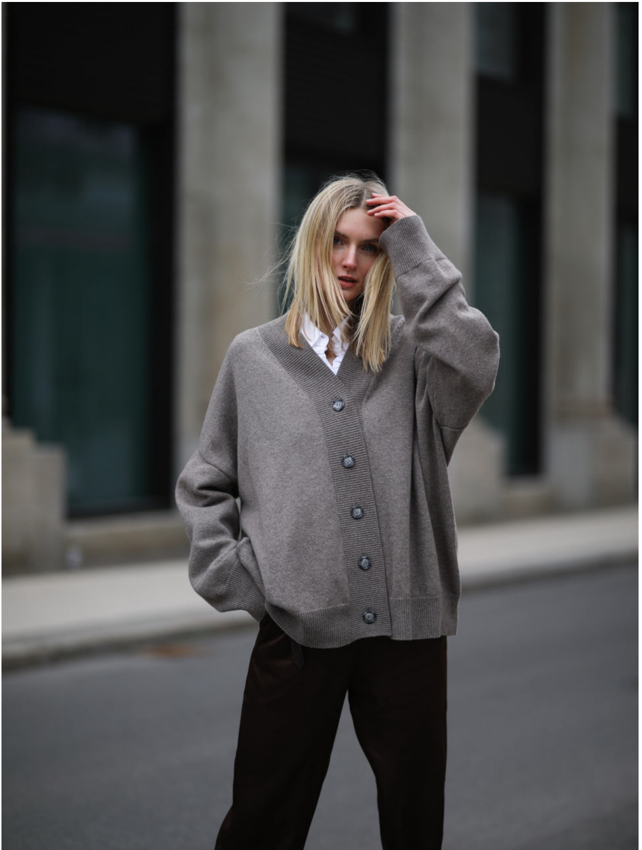
Sue Cardigan- Farbe: Azteco & Grey Art.-Nr.: M321654 VK-Preis: 349,00€ Größe: One Size Material: 90% Wool 10% Cashmere