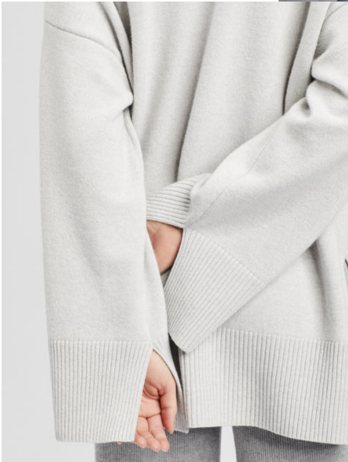
Victoria Pullover - Farbe: Light Grey & Bamboo Art.-Nr.: M321653 VK-Preis: 269,00€ Größe: One Size Material: 90% Wool 10% Cashmere